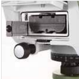
EASY DATA TRANSFER