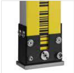
USE STANDARD INVAR STAFF