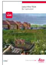
Leica Viva TS16

Illustrations, descriptions and technical data are not binding. All rights reserved. Printed in Switzerland – Copyright Leica Geosystems AG, Heerbrugg, Switzerland, 2015. 841871en – 10.15 – INT