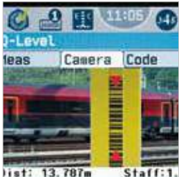
DIGITAL CAMERA AIMING