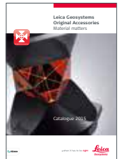
Leica Original Accessories