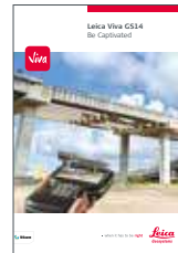
Leica Viva GS14